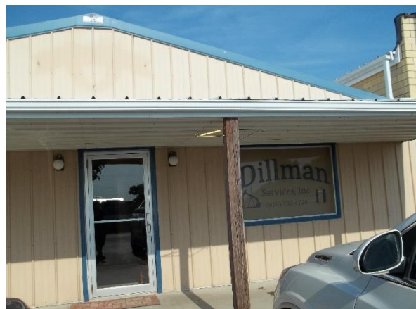
Dillmans is a locally owned White County based oil industry supplier.