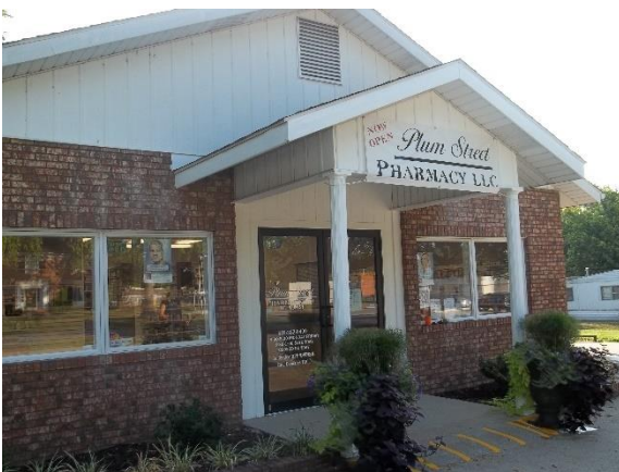
Plum Street Pharmacy is a locally owned startup business in White County.