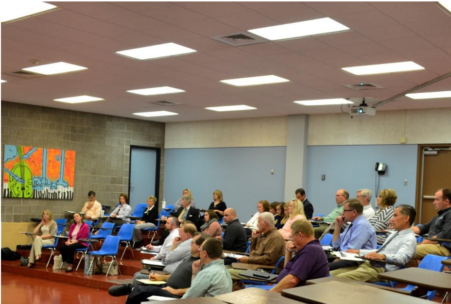
LEFT: Meeting at Wabash Valley College November 2016 on Cooperative Solutions